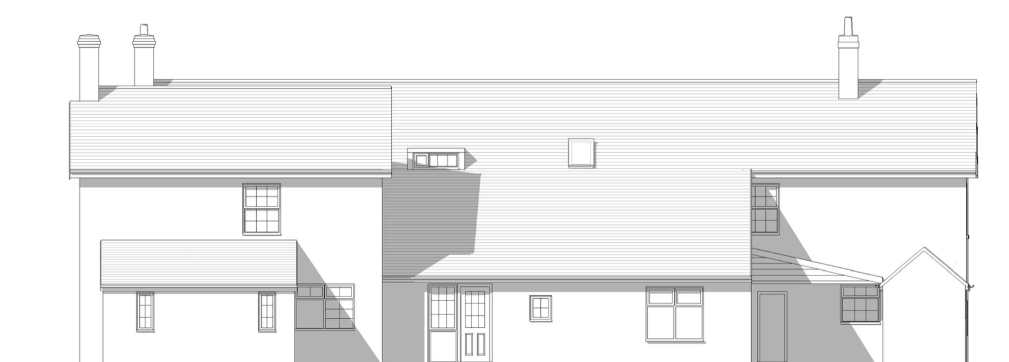
North West Elevation (Rear)