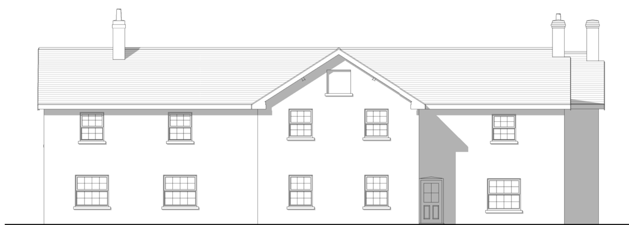
South East Elevation (Front)